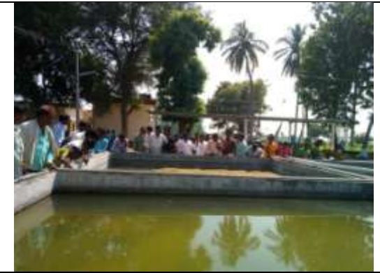
Conducted Exposure Visit to Fisheries Research Station, Palair