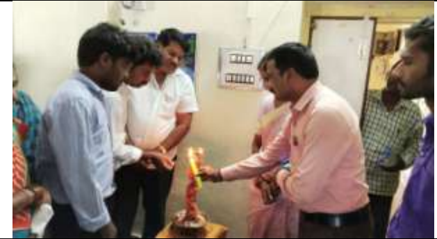
Inaugural session with lamp lighting

The post evaluation test conducted and received feedback about the training from the trainee participants on 31<sup>st</sup> October, 2018.