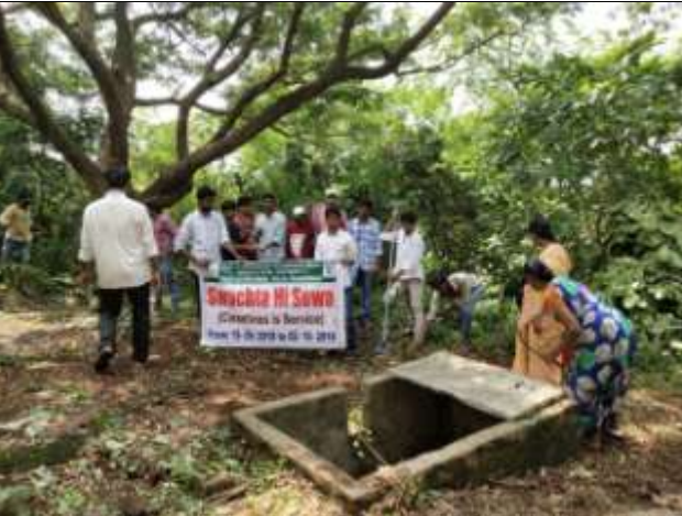
Cleaning of KVK building back side