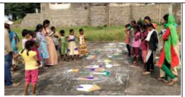
Drawing competition to the School children on "Importance of women farmer in Agriculture"