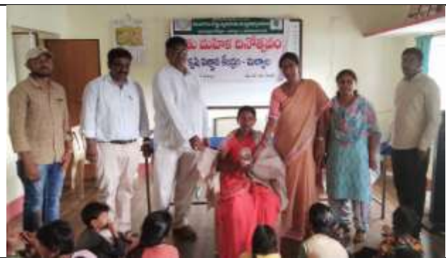
Felicitation of the Woman farmer

Conducted 3 days Training Programme on "Community tank management for enhancing fish production" from 23<sup>th</sup> to 25<sup>th</sup> October 2018 to the fish farmers/ fishermen with the financial assistance of NFDB, Hyderabad.