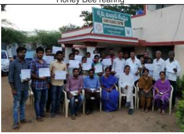
Successful completion of the training