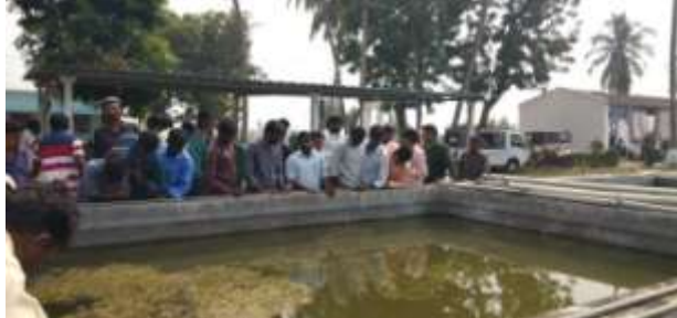
Conducted Exposure Visit to Fisheries Research Station, Palair